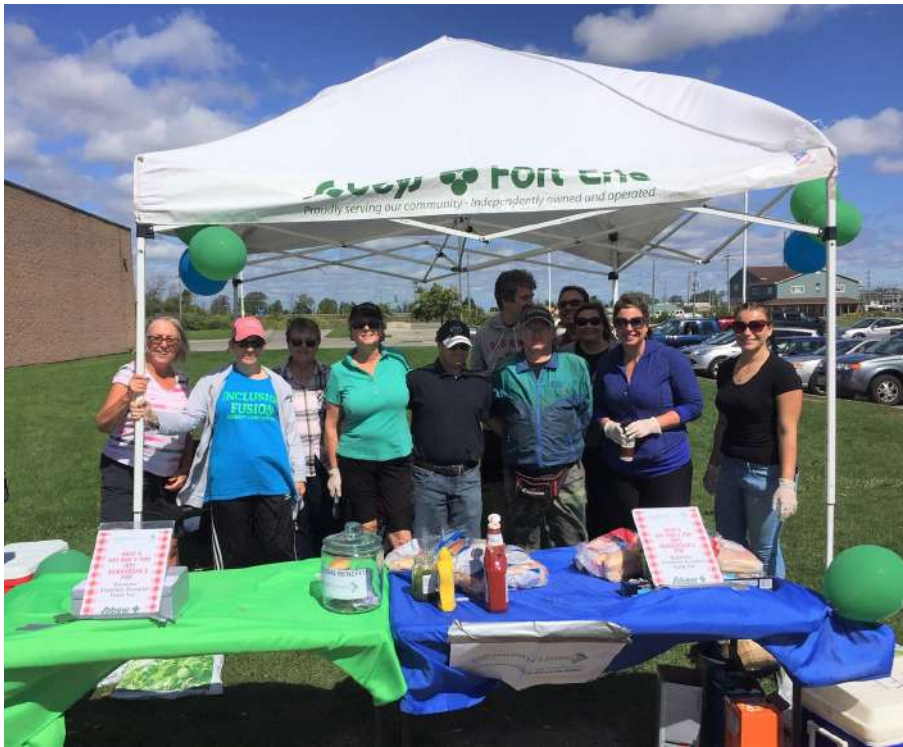
Volunteers Serve it Up!