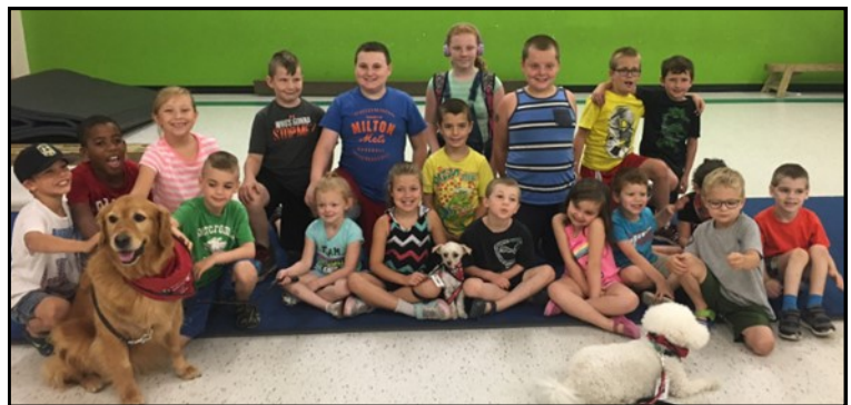
Photo: Campers are enjoying some time with St. John's Ambulance Therapy Dogs. They had the opportunity to see three different dogs, learn about the care, feed them treats and enjoy their company.

Providing support to campers through the summer takes a great deal of commitment from the families, program counselors and inclusion facilitators, Community Living and along with the camp providers. We worked together to develop programming, modifications and inclusion for our young friends to have a fun and enjoyable summer experience filled with learning and laughter.